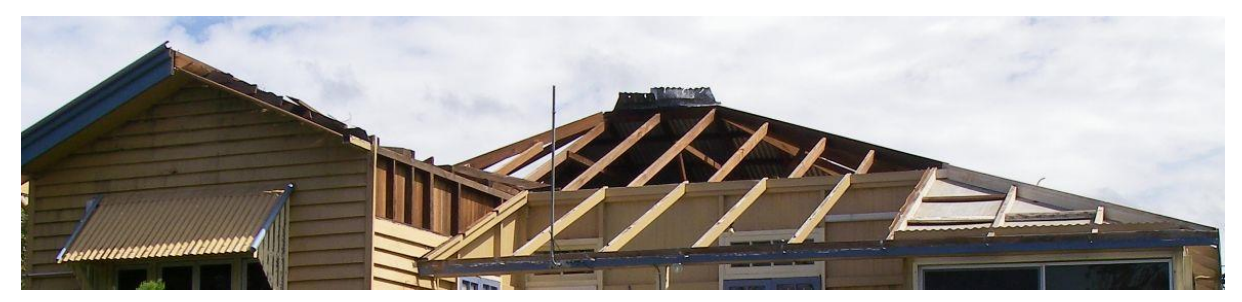
Figure 2. Part of the roof cladding with battens still attached flipped on to the leeward side

Figure 1. Removal of roof cladding and battens from wind ward face