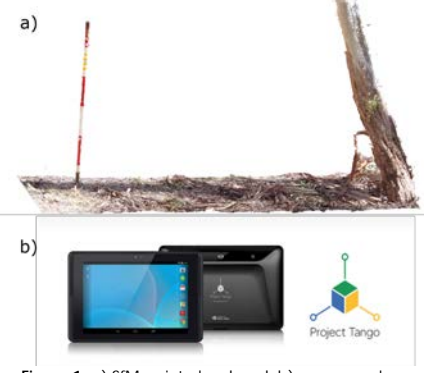
Figure 1. a) SfM point cloud and b) an example structured light device.

Utilising overlapping optical imagery to derive 3D structure has re-emerged as a viable technique to map our environment. Structure from Motion (SfM), is one such technique that can generate dense 3D point clouds (figure 1a). Using SfM, lowcost Point-and-shoot cameras provide sufficient information to generate highdensity structural information describing the surrounding environment.