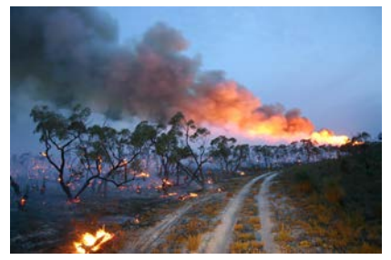
Figure 1: Controlled burning at Lillimur, Victoria (DELWP, 2007)

THE VICTORIAN GOVERNMENT IS COMMITTED TO EXPANDING ITS FUEL MANAGEMENT PROGRAM, AND TO REPORT ON THE EFFECTIVENESS OF PLANNED BURNING AND REDUCING BUSHFIRE RISK. THE DEPARTMENT OF ENVIRONMENT, LAND, WATER AND PRIMARY INDUSTRIES (DELWP) HAS IDENTIFIED THE NEED TO IMPROVE CURRENT APPROACHES TO BURN EXTENT AND SEVERITY MAPPING. THIS PROJECT WILL EXPLORE IMPROVED REMOTE SENSING AND FIELD DATA METHODS FOR CAPTURING, ANALYSING AND REPORTING ON BURN EXTENT AND SEVERITY.