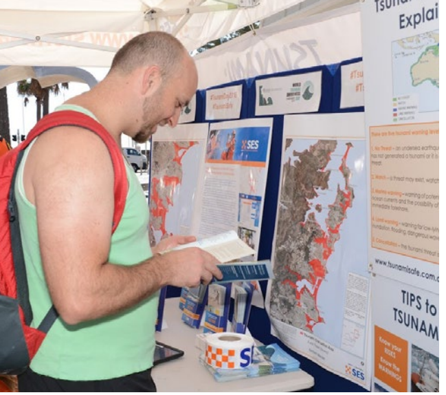
Using local maps should be part of community-based planning for a tsunami.