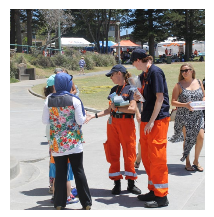
NSW SES personnel speaking with people about the tsunami risk in their local area.