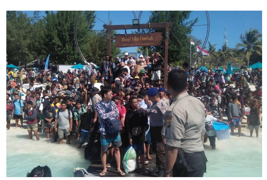
"People attempting to leave Gili Trawangan on the day after the quake"

Response was uncoordinated and there was insufficient transport capacity to account for the mass exodus