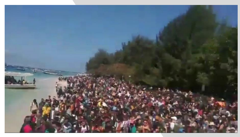
Basarnas personnel, "Tourists on the beach of Gili Trawangan, waiting to evacuate".