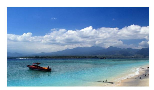
Laurent Bigué, Gili Air Eastern coast looking at Lombok".