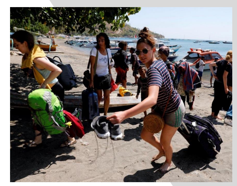
"Tourists carry their belongings as they leave Gili Trawangan".

Almost all interviewees were between 18 and 60 years old