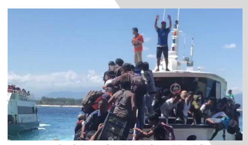
One News Page, "Terrified tourists flee Gili Islands after Lombok quake"