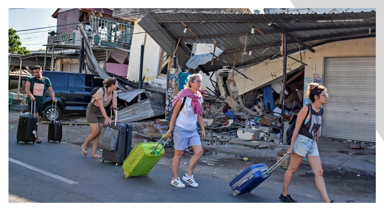
The Cairns Post, "Bali resort town is back in business after Lombok quake".