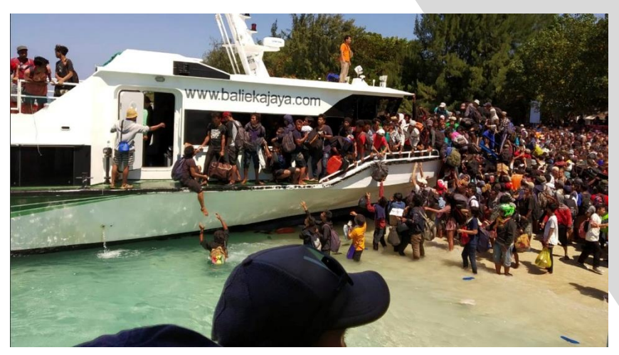
AP, "Rescue vessels are said to be leaving half empty with 'selected' evacuees".

"People are punching and hitting each other." (Interviewee)