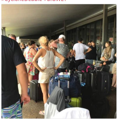
12:10 AM - 30 Mar 2017

Crazy queues at the Hamilton Island airport...friend says she's witnessed the best and worst of people as they leave #CycloneDebbie #BIGWET