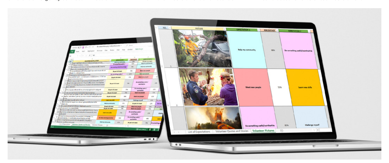
▲ Above: A SAMPLE FROM THE RECRUITMENT MESSAGING TOOLKIT, SHOWING VOLUNTEER PHOTOS AND THE IMPACT THAT SEEING THEM HAS ON EXPECTATIONS OF THE ROLE SOURCE: CURTIN UNIVERSITY.

After collating a set of 109 quotes and 40 photographs, this study identified which ones were most suited for effective recruiting. From a larger set, researchers identified 61 quotes and 28 pictures that were rated as being accurate by current SES volunteers, and attractive by both current and potential volunteers. These messages were therefore viewed as viable candidates for a volunteer recruitment