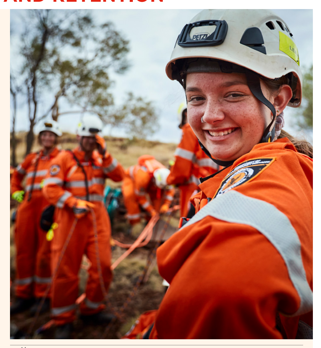
Above: This research provides helpful resources that support emergency volunteer managers in their recruitment, retention and management of volunteers

The Recruitment and Retention Toolkit for Emergency Volunteer Leaders is based on relevant models of psychological behaviour and extensive new research with brigade, group and unit (BGU) leaders and volunteers. It is designed to assist with all stages of volunteer management and is accessible via the Future Workforce theme on the CRC's